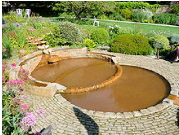
Chalice Well Gardens